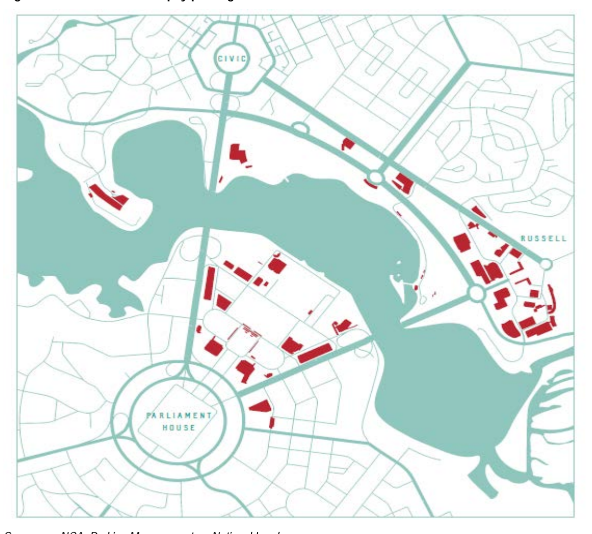
Figure 1.1 Introduction of pay parking on National Land

employment centres in Canberra. The NCA will implement the pay parking arrangements on behalf of the Australian Government. The money raised—an expected $73.3 million—will go to consolidated revenue.