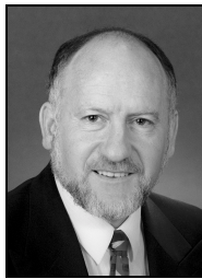
John Forrest MP