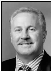
Senator Shayne Murphy