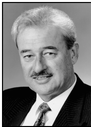
Senator Alan Ferguson