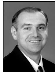
Bernie Ripoll MP