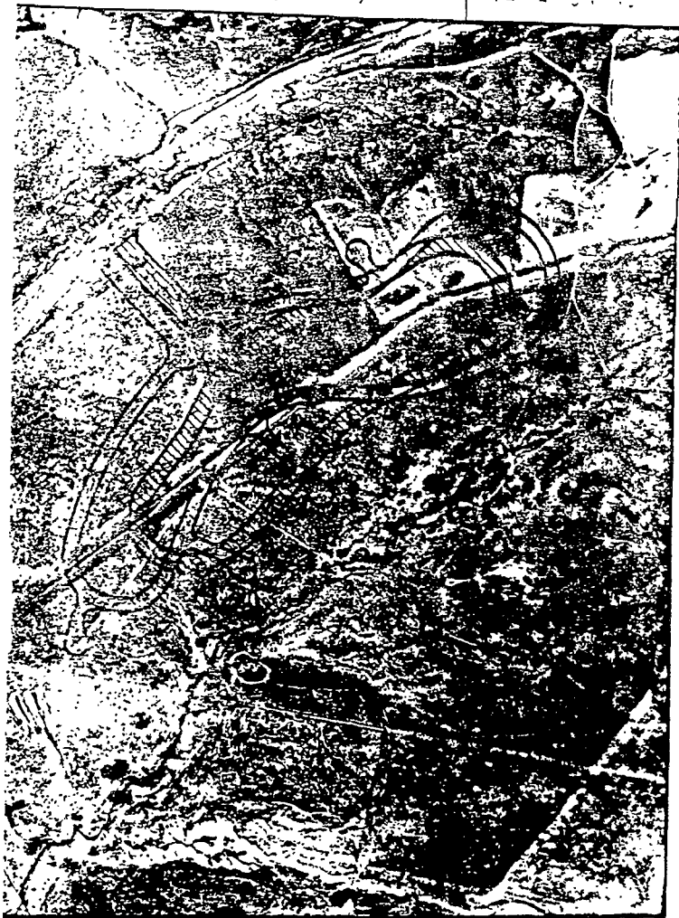
KAMBAH: Section 7 - Road Addition and Deletion